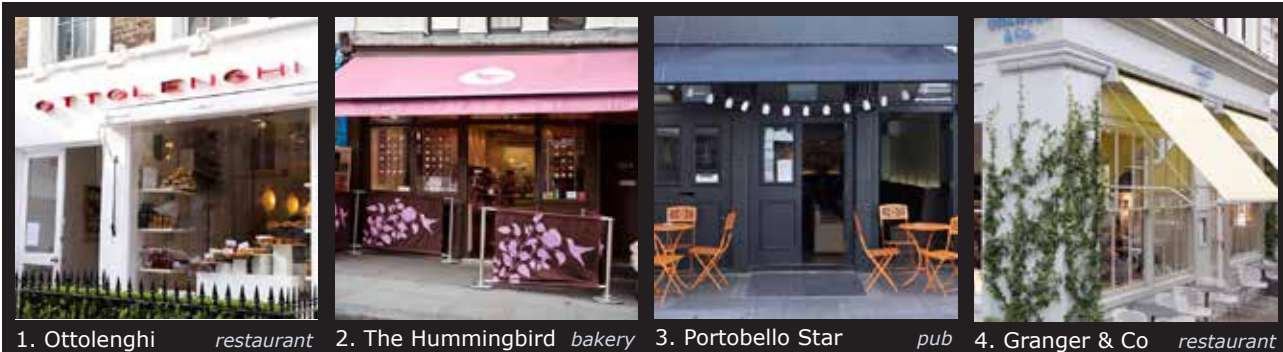
1. Ottolenghi restaurant 2. The Hummingbird bakery 3. Portobello Star pub 4. Granger & Co restaurant