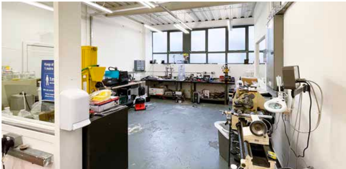
LOWER GROUND STUDIO